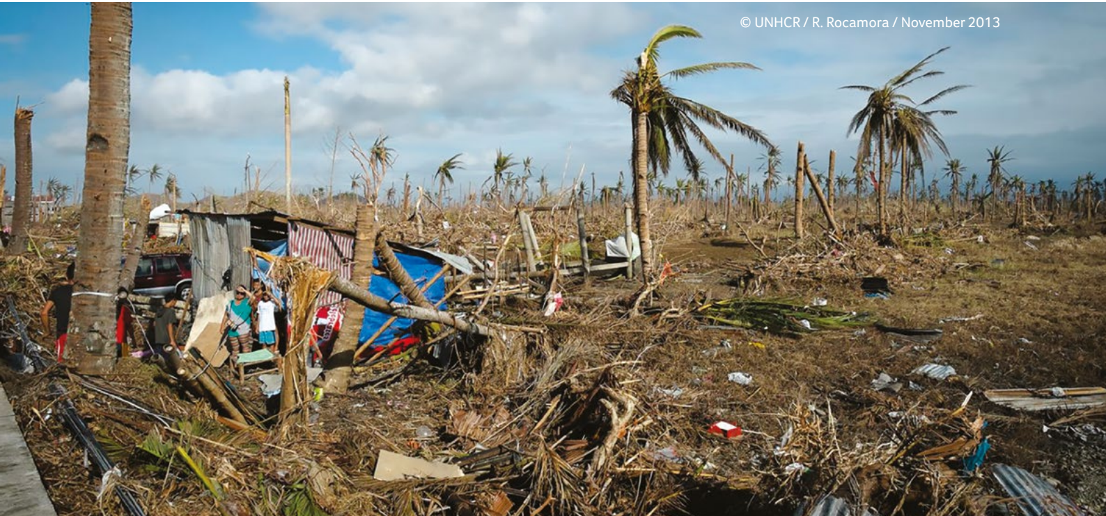
© UNHCR / R. Rocamora / November 2013